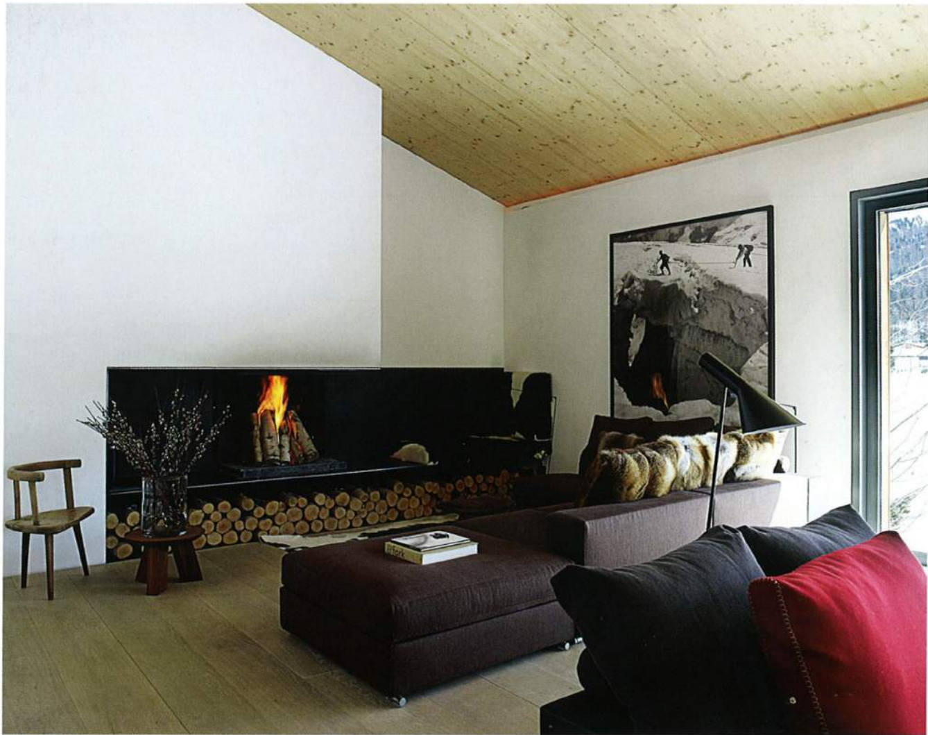
The main sitting room is on the upper level of the house, with a large fireplace at one end and picture windows. The sofas are by Antonio Citterio, as are the armchairs covered in cowhide.