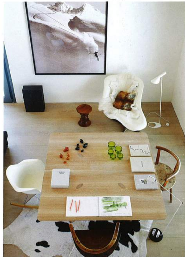
A mezzanine gallery, which serves as a television room, den and library, looks down onto the main sitting room. The furniture is a mix of contemporary pieces and mid-century design classics.