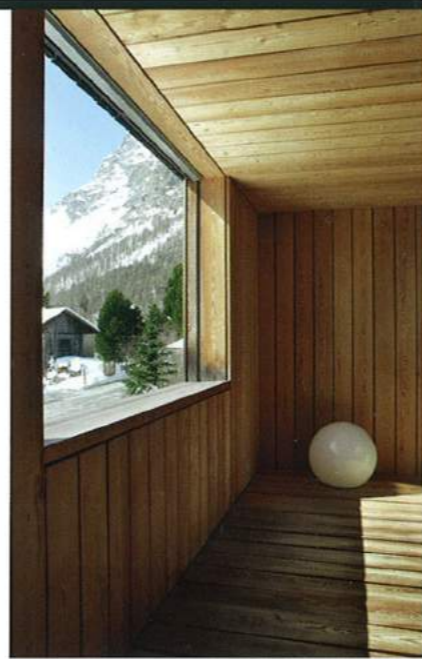
The towering mountains of the Upper Engadine valley form a powerful backdrop to the house, with large picture windows that make the most of the views.